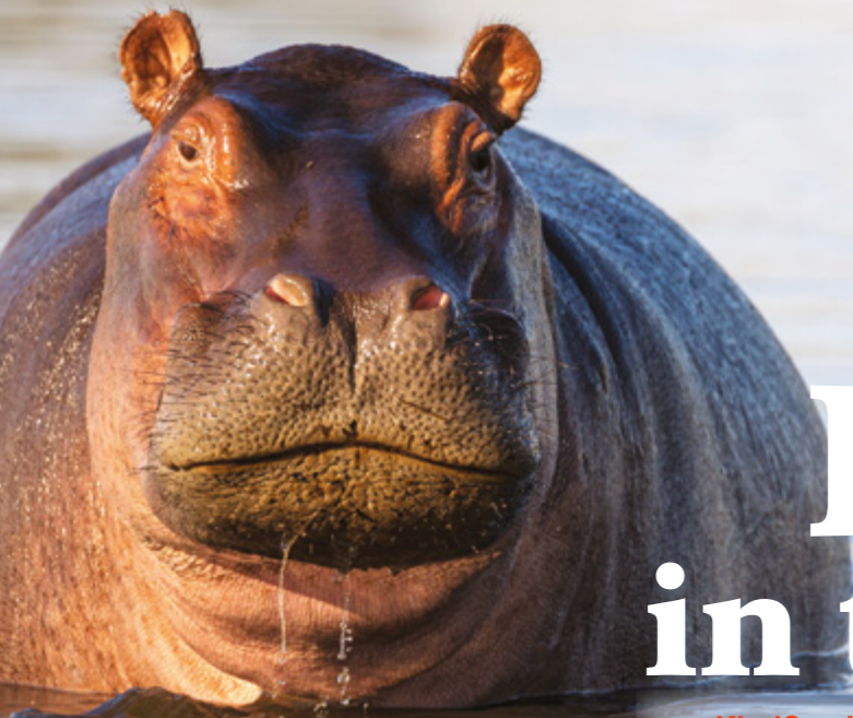
Common hippopotamus ( Hippopotamus amphibius ).