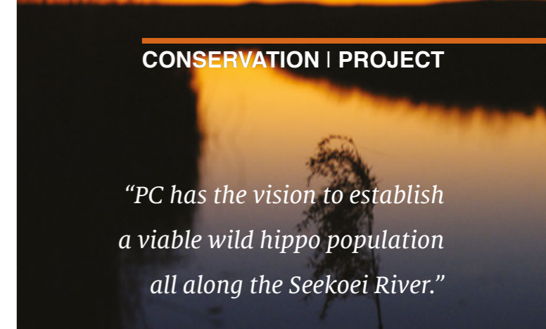
Seekoei River sunset.

“PC has the vision to establish a viable wild hippo population all along the Seekoei River.”